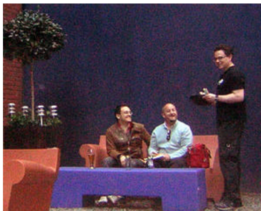
The garden patio at XES, a little gem hidden on a side street in Chelsea is also one of the bars offering an outdoor space. Careful: It's spacious but gets crowded, especially on Friday nights.

• XES lounge in Chelsea ( 157 W. 24th St.) boasts one of the largest outdoor patios in the area and is open seven days a week. On Sundays they start with a beer blast from 4-9pm, "Desperate Housewives" afterwards on the big screen TV inside, and then a post-show performance by Cashetta. Because the bar is situated in a residential area, though, the patio closes at 11pm on weeknights and midnight on weekends. But it opens daily at 4:00pm for happy hour and will no doubt host many other festive gatherings throughout the summer.